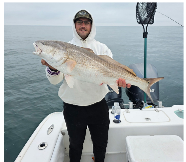
Top: Good catch but good cleaning but Great eating Bottom: I am dreaming of great eating this Sheepshead.

The marina is ready and the weather is here and best of all, The Fishing Is Good.