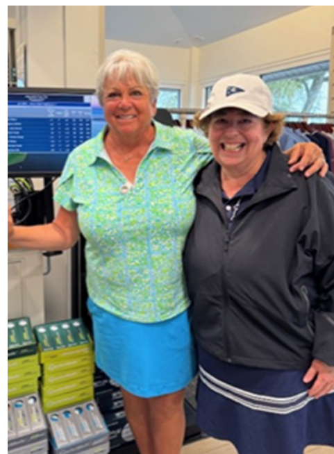
Fripp Cup-Member/Member Winners