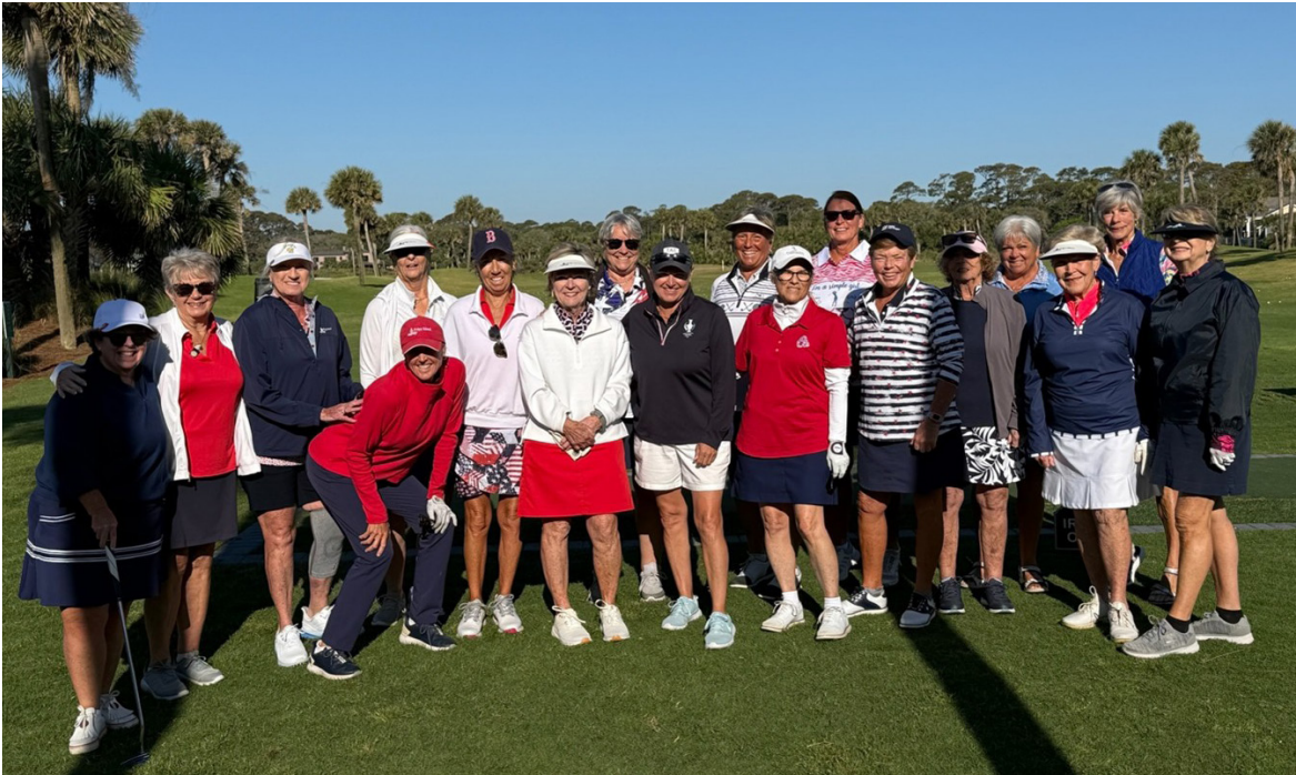
Coastal Cup - Fripp vs. Dataw

Our Spring season has started off with two big Wins for the Fripp Islands Women's Golf Association (FIWGA). First, March 24th on a cold and blustery day, the women won the "Battle of the Sexes." We retained our bragging rights for best golf league on Fripp!! Conditions were barely playable but we hung in there and brought our "A" game. WGA 14-1/2 MGA 12-1/2. Pretty tight match!!