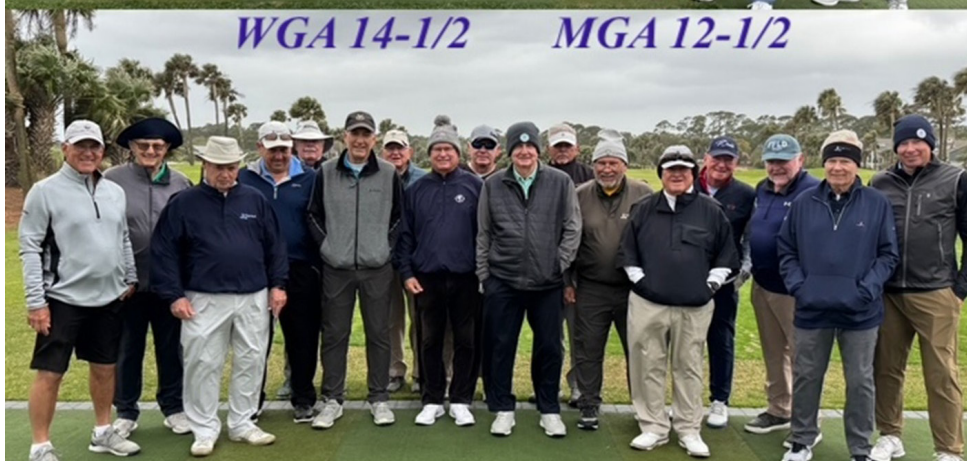
Battle of the Sexes